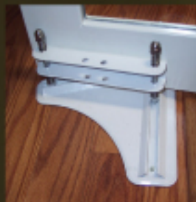
TOTAL ACCESS SLIDING HINGE